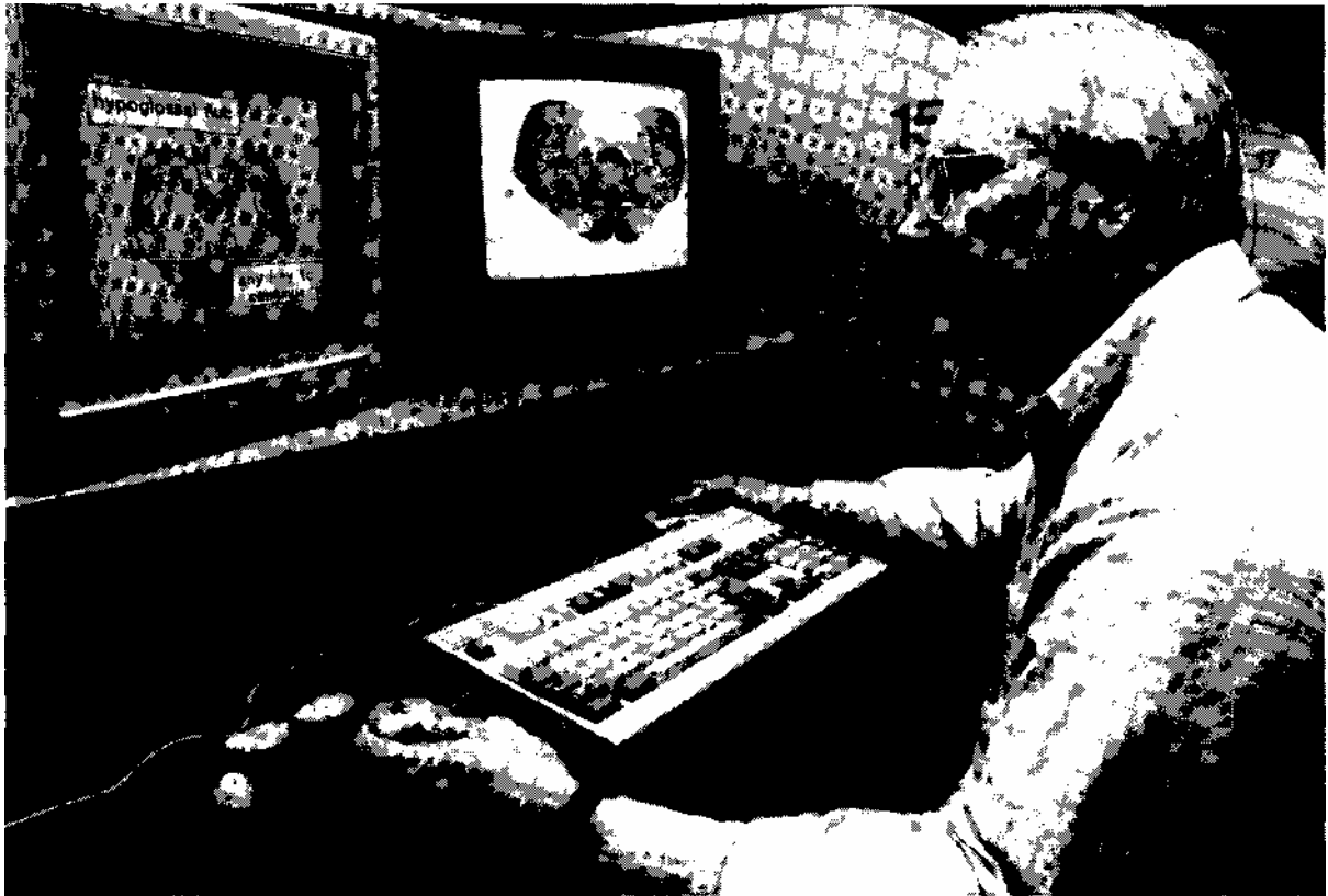
Figure 1. Work station with 286 PC computer, laser video disk player, and dual monitors.

The use of computer assisted learning modules with plastinated tissues has several advantages for both the students and instructors. For the students, there is little wasted time in working through the modules. Errors in identification are reduced by having a labeled drawing on the computer screen linked with an unlabeled slide on the video disk monitor. The combining of plastinated tissues as an integral part of each computer lesson is important, because historically students have tended to separate the study of the gross brain from the study of the histologic sections of the brain. This often resulted in failure to synthesize the two parts into an integrated whole. By using onscreen instructions and labeled graphics to direct students to plastinated tissues, integration is facilitated.